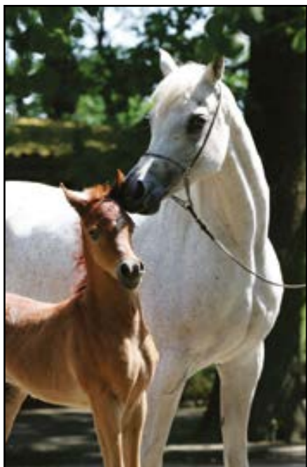
NK Nasrin (Adnan x Nashwa by Salaa El Dine)