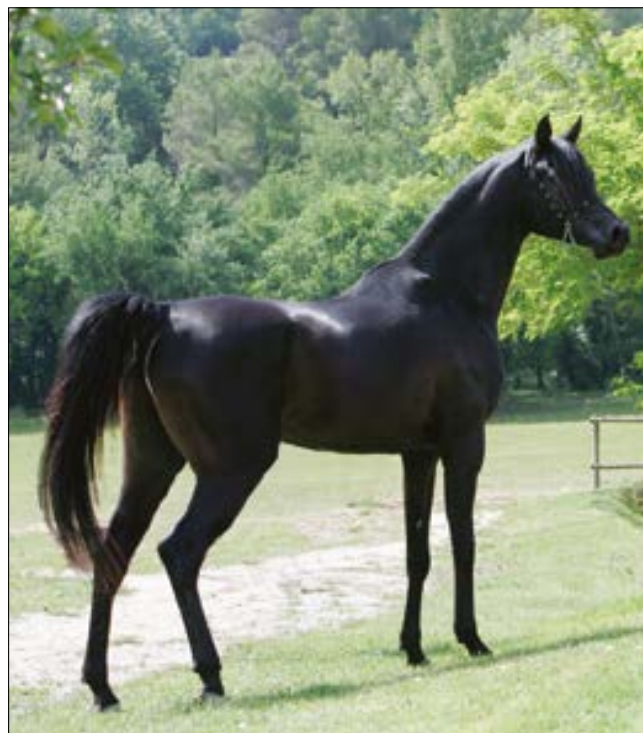
TB Yasir (Salaa El Dine x Sulifah) Breed by Tre Balzane Stud.