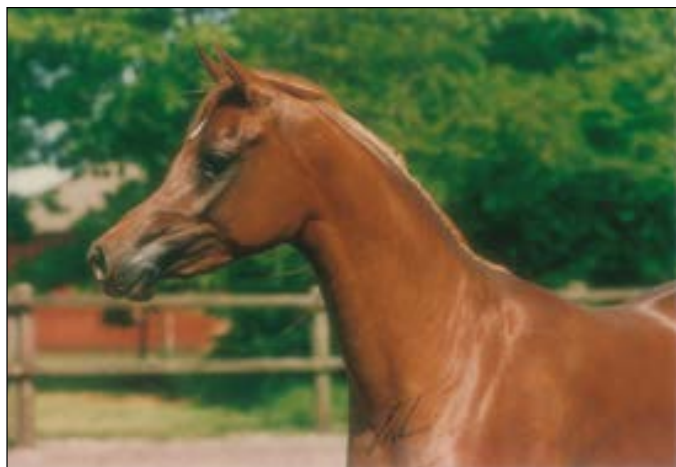
Nashua (Salaa El Dine x Lotfeia), bred by H.J. Nagel