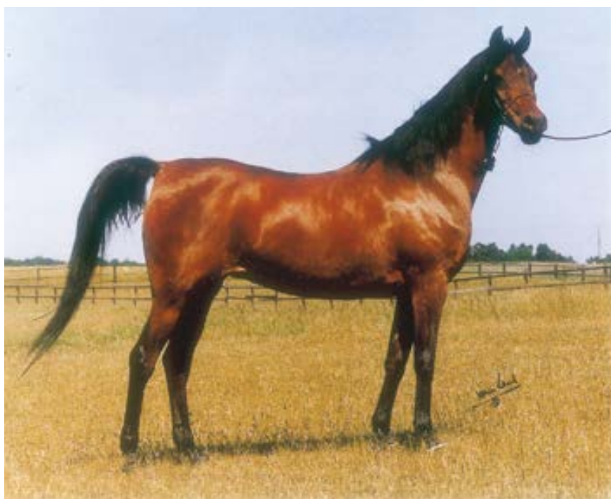
Hanan (1967, Alaa El Dine x Mona)

Two other Madkour 1 daughters, Arussa and Ameera, made significant but lesser contributions, and two other sons - Ibn Galal I (by Ibn Galal) and Asfour (by Malik) - became great sires at their respective stud farms of Babolna in Hungary and Simeon Stud in Australia. That means that at least 7 out of her 11 foals became outstanding horses and breeding animals – a record surely unmatched by any other mare in history.