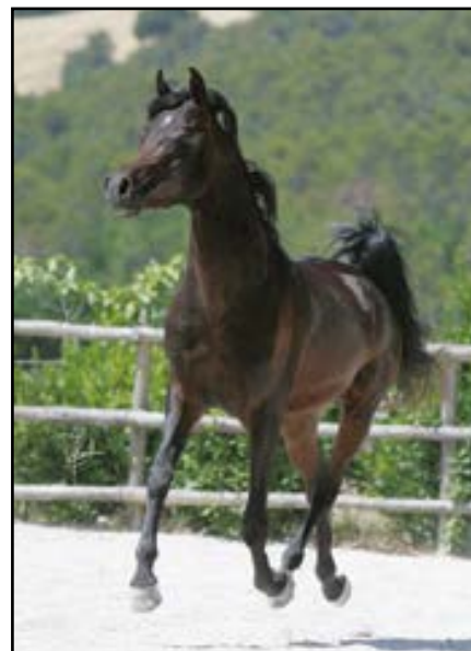
NK Mudeer (NK Nadeer x Ansata Ken Ranya by Salaa El Dine)

There are many good mares, in my own stud as well as in other breeders' stables. The Salaa El Dine mares with the greatest influence on Katharinenhof stud itself are