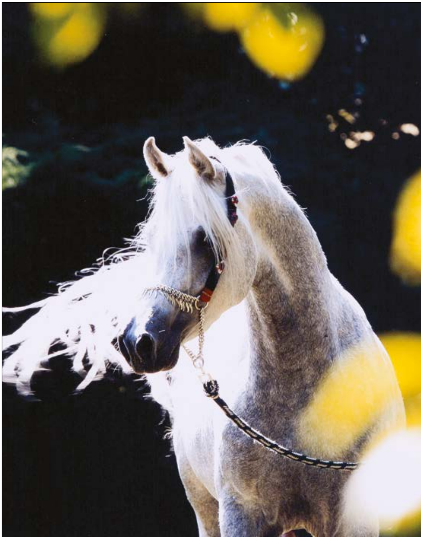
Salaa El Dine (1985, Ansata Halim Shab x Hanan )