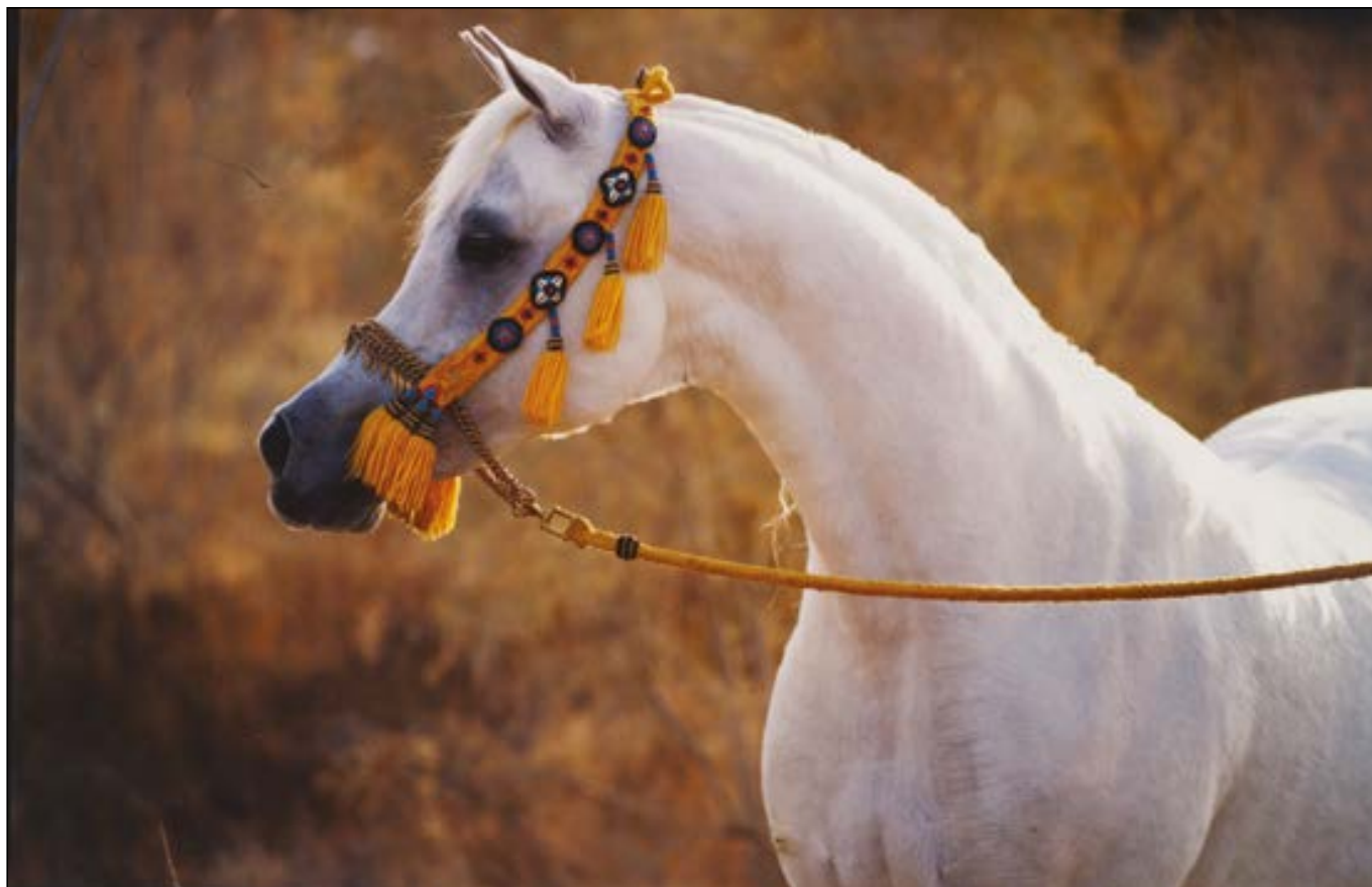
Ansata Halim Shah (Ansata Ibn Halima x Ansata Rosetta)