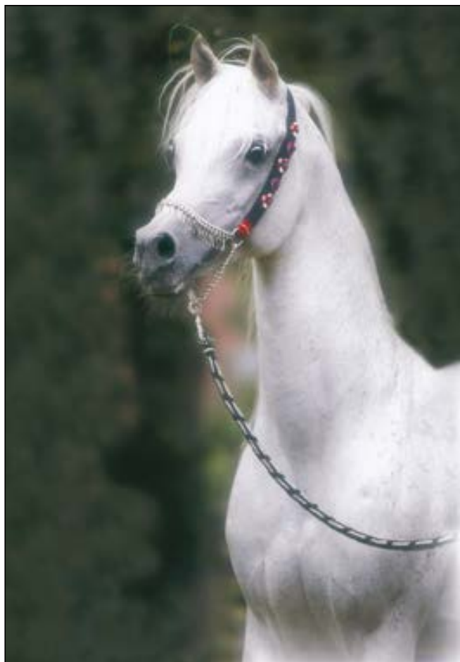
Salaa El Dine (Ansata Halim Shah x Hanan)