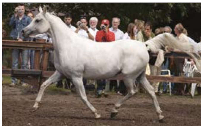
NK Nariman (Salaa El Dine x Amrullah)