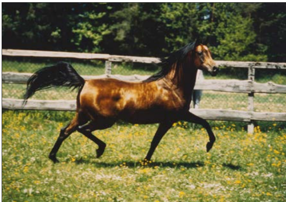
Hanan (Alaa El Dine x Mona)