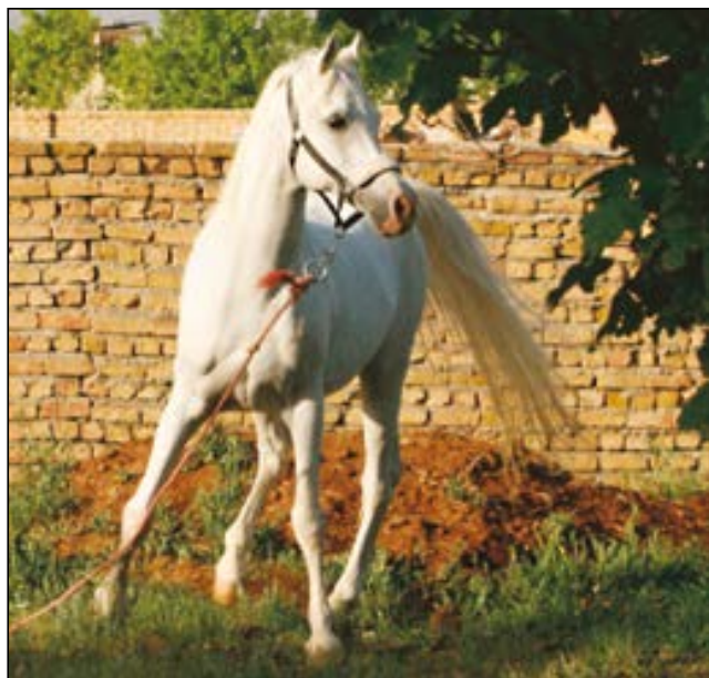
Mubarak (1990–2012, Salaa El Dine x Myrna), bred by H.J. Nagel