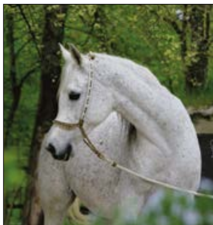
Ken Bint Amal (Salaa El Dine x Ken Amal)