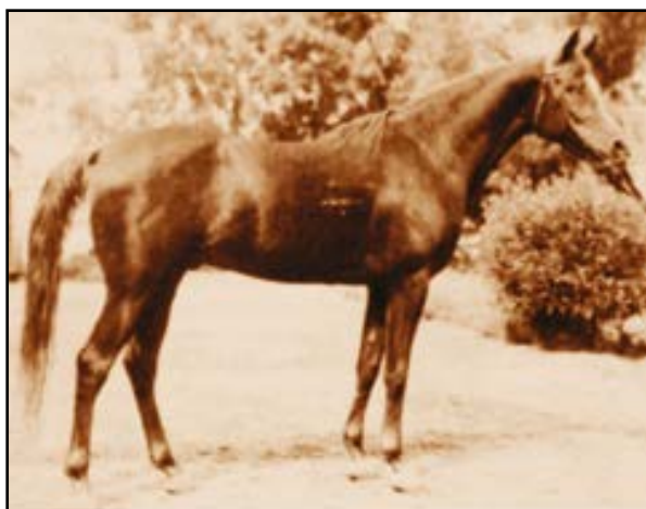
Alaa El Dine (1956, Nazeer x Kateefa)