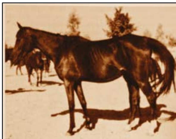
Mona (1956, Badr x Mahdia)