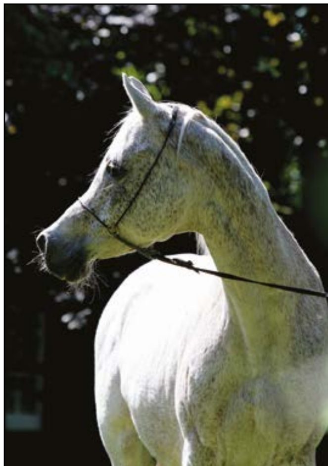
Ansata Ken Ranya (Salaa El Dine x Ansata Prima Rose)